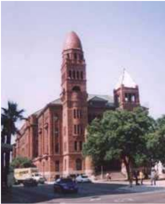
The Bexar County Courthouse, the oldest and largest continuously operated Texas Courthouse, before restoration and façade stabilization, lighting and plaza re-design