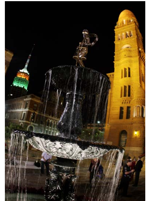
Lady Justice as seen at her debut, December 7, 2008

The original J.L. Mott fountain was purchased new in 1892 and placed in an eastside court entry of the Bexar County Courthouse upon completion in 1897. After a move in 1927 and a tragic experience with vandals in 70 years later, the fountain was recovered by the Hidalgo Foundation, a nonprofit formed to restore the historic Pecos sandstone Courthouse. On December 7, 2008, the beautifully restored cast iron fountain and newly created Lady Justice sculpture were unveiled and dedicated to the legal community of Bexar County, Texas.